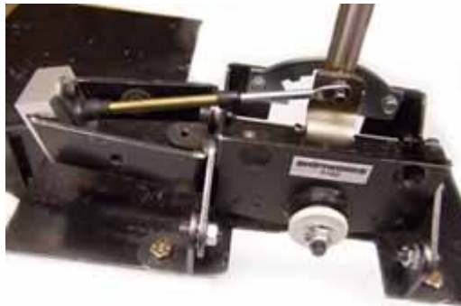
B&M Cable installed using Shiftworks adaptor.

The Ford C-4 and C-6 cable installation is based upon the use of a B&M Cable and cable installation kit. The C-4 transmission will use the B&M Bracket and Lever kit #50498, and the C-6 will use kit #40497. Shiftworks will supply its own lever and an adaptor to use on the shifter to mount the B&M cable system.